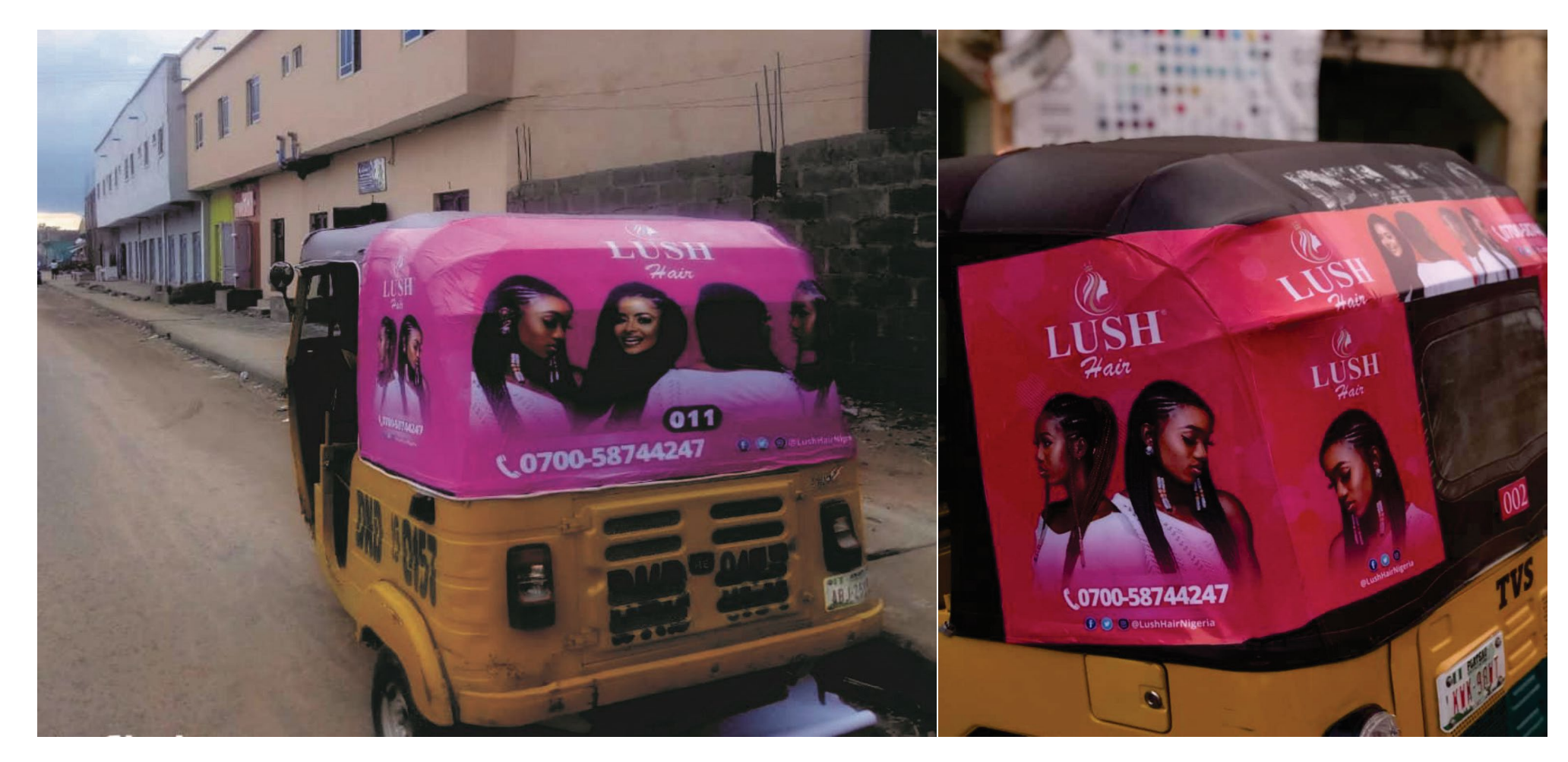
Fast Moving Consumer Goods (FMCGs) can use it to remind people going to market