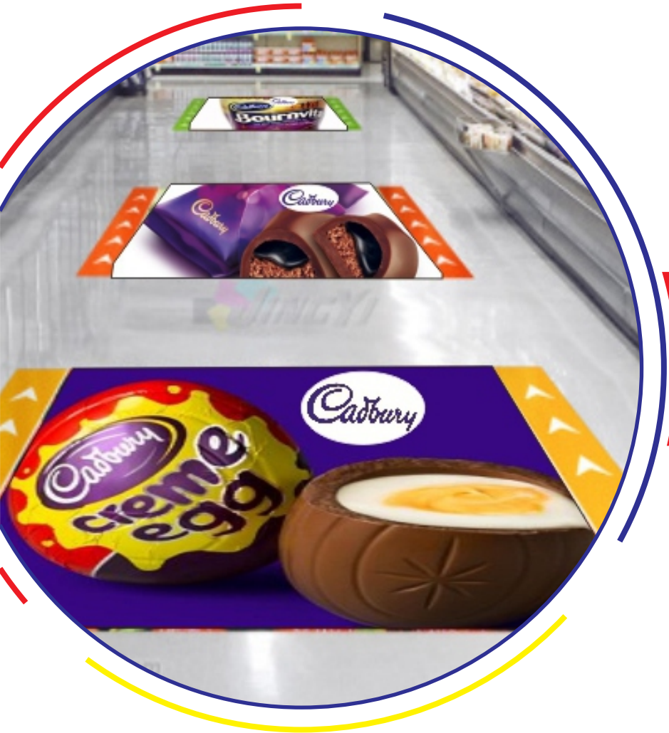
Advertising Floor Sticker (Vinyl self-Adhesive)